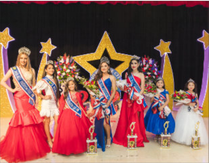
MISS FREEDOM FEST COURT 2022 - The City of Rio Grande City thanks the entire 2022 Miss Fest Court for the year of service and dedication to our community.